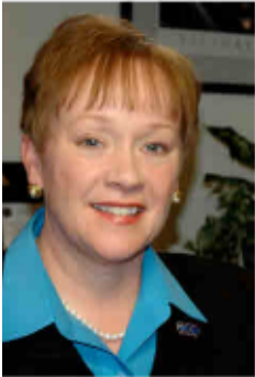
Steelworker Endorsed Candidate for Governor