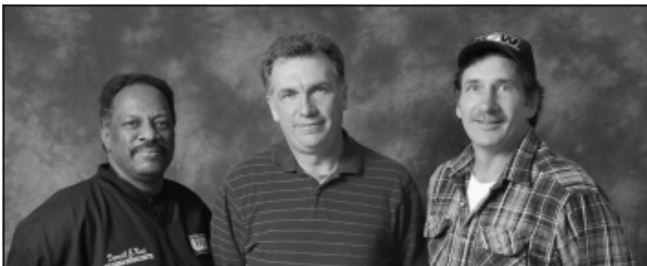
Pictured above: Local 1010 Executive Board Left: Local 1010 Grievance Committee